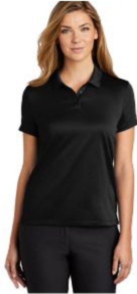
Nike Women's Dry Essential Solid