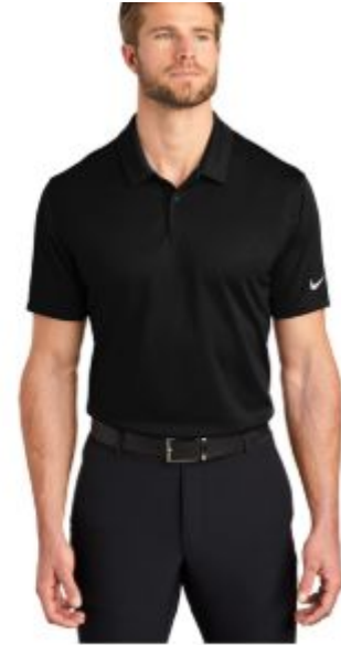
Nike Dry Essential Solid Polo

Link to Order DARTEP Wear after you have paid your dues.